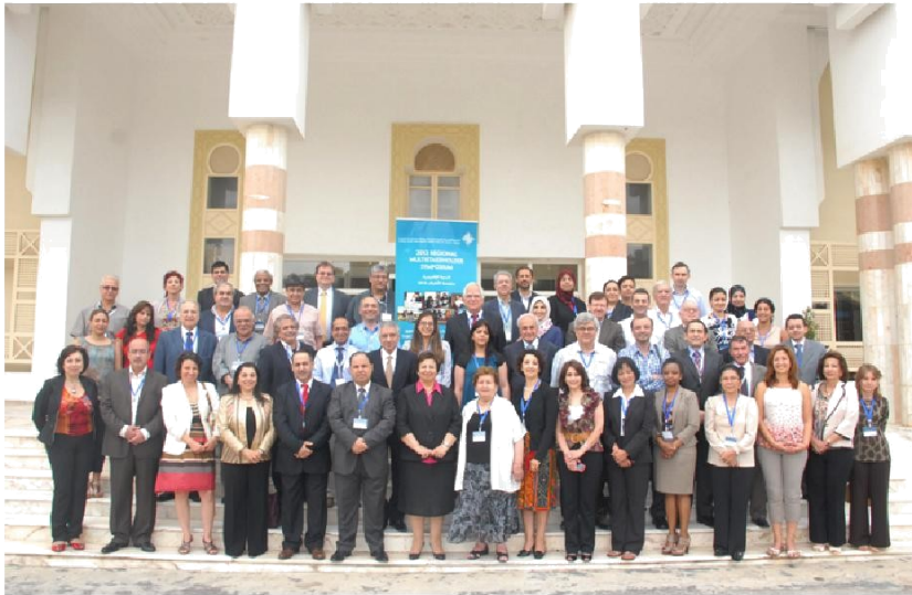
Participants of Tunis Regional Symposium